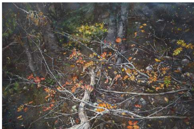
Tangle by Xi Guo

NWS Gallery, 915 S. Pacific Avenue San Pedro, CA 90731-3201