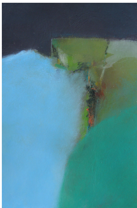
Coastal Anxiety Stan Kurth 97th International Exhibition