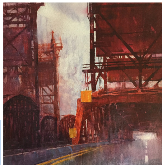
Bridge Study in Red William Hook 97th International Exhibition