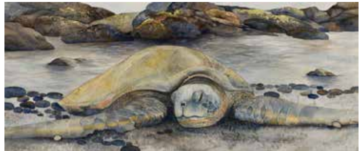
Don't Bother Me

I say that if it is your love and calling, then go for it. Even if you can't make a living as a studio artist, there are many related careers that keep you in touch with art in general, create relationships that may lead to studio art, or may give you time to pursue studio art in your spare time. If it's in your blood, you will find a way.