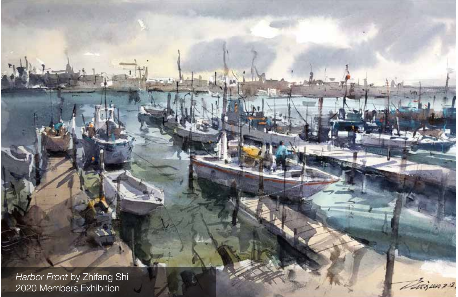
Harbor Front by Zhifang Shi 2020 Members Exhibition