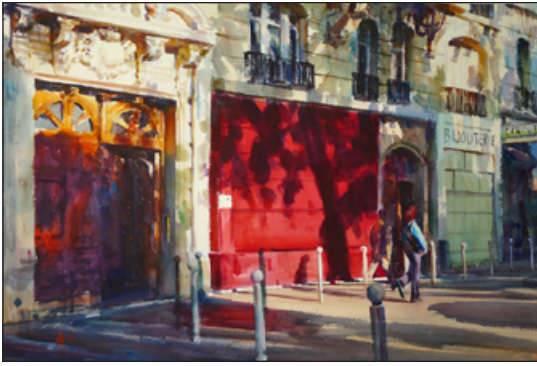
Red Door Xidan Chen