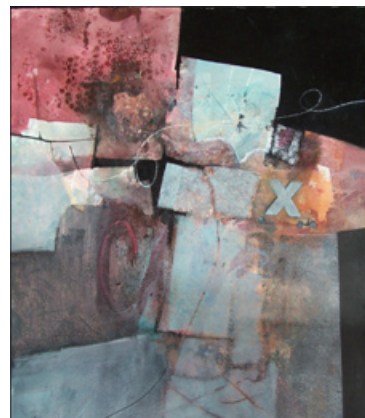
Line Dance 10

To increase the chances of acceptance, get together with a group of artists, whose opinion you respect, project your work and if the group exclaims, send that one.