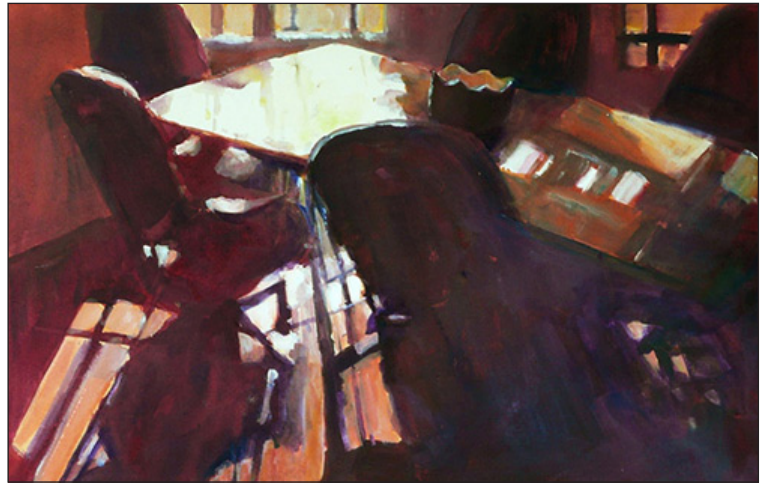
Breakfast Room Light 1 Judy W. Rider

The 2010 Traveling Exhibit is winding down! If you are in the area, do make a point of checking it out at the following locations: